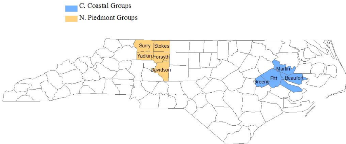
Map 2. Central Coastal and Northern Piedmont NC Participants' Counties of Residence

The younger Central Coastal North Carolina group consisted of twelve producers from Beaufort, Greene and Pitt counties with an average age of 37 years. All of the producers were full-time farmers with flue-cured tobacco production ranging from 65 to 365 acres with an average of 150 acres. There was also one producer who produced around 17 acres of burley. Other crops produced included corn, wheat, soybeans, cotton and peanuts and averaged approximately 1,500 acres.